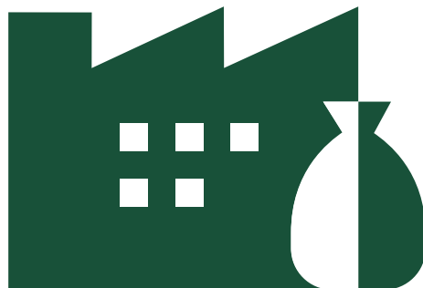
Commercial and industrial waste