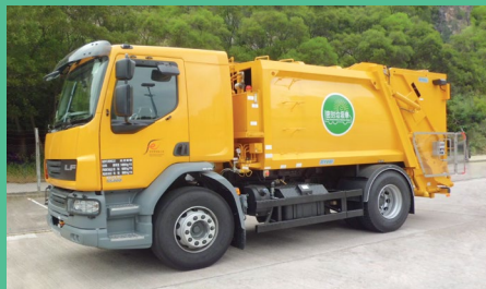
FEHD's RCVs with rear compactors