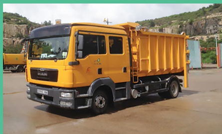
FEHD's RCVs without rear compactors 5