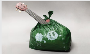
Some of the waste protrudes from the opening of the bag