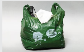
The opening of the bag is not tied well and the waste inside escapes