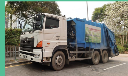
PWC's RCVs with rear compactors