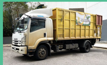
FEHD's contractors' RCVs without rear compactors 5