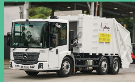
FEHD's contractors' RCVs with rear compactors