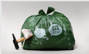
Some of the waste pierces through the body of the bag