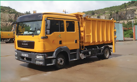
FEHD's RCVs without rear compactors 5