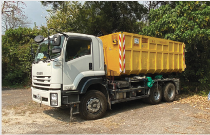
PWC's RCVs without rear compactors 5

"Designated bags/designated labels are not applicable under the "charging by weight" arrangement. Members of the public do not need to wrap their waste in designated bags or affix with a designated label on each piece of oversized waste; otherwise it would lead to double payment."