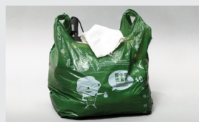
The opening of the bag is not tied well and the waste inside escapes