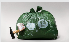
Some of the waste pierces through the body of the bag