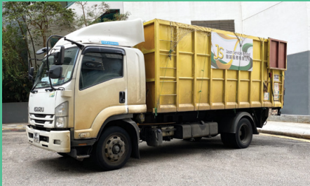
FEHD's contractors' RCVs without rear compactors 5