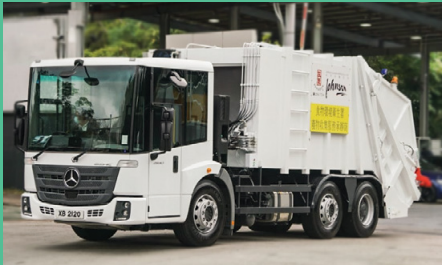
FEHD's contractors' RCVs with rear compactors