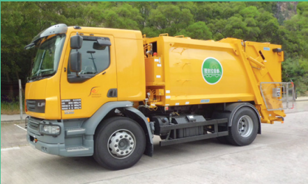
FEHD's RCVs with rear compactors