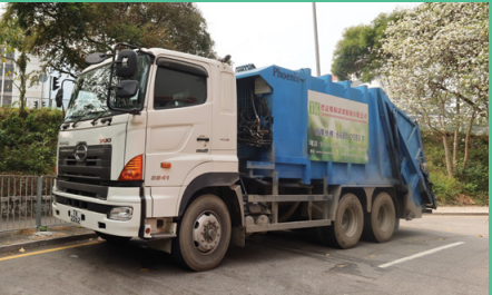
PWC's RCVs with rear compactors