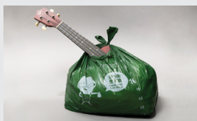
Some of the waste protrudes from the opening of the bag